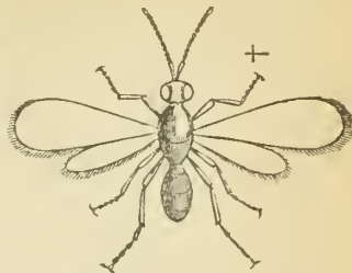
FIG. 1.—Egg-parasite of the Hessian Fly.

It is shining black; the head is finely punctured, rounded, and slightly broader than long, being about as wide as the thorax. The antennae are about as long as the head and thorax; they are slender, but apparently a little stouter than in P. error , the penultimate joints being a little broader and squarer than he represents (and they are very different from Platygaster tipulae ), these joints not being "twice as long as thick," but only \frac{1}{4} to \frac{1}{3} longer, much as represented by Fitch in his figure;* the terminal joint is long, oval, not so wide as those just behind it, and it tapers to a